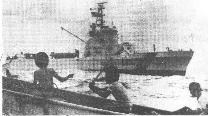
Coast Guard men observing a group of challenging fishermen.

Vieques, otherwise known as Isla Nena, is a small island, 6 miles southeast of Puerto Rico. It is a municipality of Puerto Rico. Vieques is surrounded by the Atlantic Ocean on the north and by the Caribbean Sea on the south. The main source of livelihood for its 8 to 9 thousand residents is fishing.