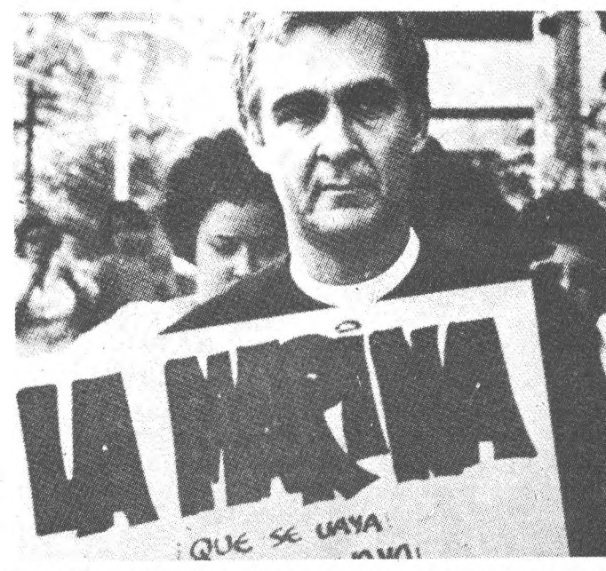
Supporters of the Vieques fishermen demonstrate their support. Sign reads: "U.S. Navy. . . . You must go!"

We undertake these tasks from the premise that the struggle of the people of Vieques to oust the US Navy from their island is part of the overall struggle of the Puerto Rican people for national and social liberation. We, therefore, ask all concerned individuals and groups to join the Viequenses in their call: "Vieques belongs to us, let's reclaim it!"