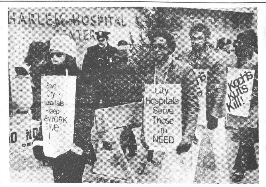
Striking doctors and supporters in front of Harlem Hospital

Just prior to the 24-hour strike, plans were modified to affect only 9 hospitals: those most directly endangered by the cuts. The HHC immediately got a temporary restraining order in the State Supreme Court to prevent the work stoppage on the