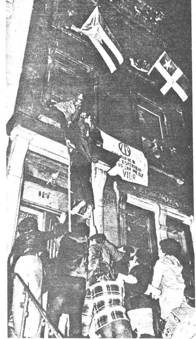
Members of OMI take over building in 1971

legal fight goes on, but other tactics must be used as well, such as the unity of all moderate and progressive forces against CONTINUE, and its racist practices in the community. The Site 30 fight is part of the wider struggle to get constructed the 2500 low-income units originally promised by the city. The leading force in this struggle is the United Tenants Association, (UTA), a tenant group representing families still living on the remaining urban renewal sites. The UTA has called for and is working to build a coalition of all community groups, lowincome and moderate families to demand that the city meet its commitment of 2500 units and that it construct low-income housing on Site 30.