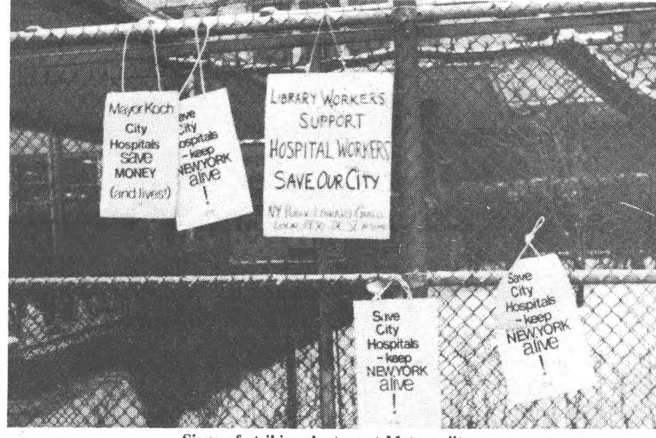
Signs of striking doctors at Metropolitan

Responses to Koch's proposed cutbacks have come from a wide spectrum of groups. Consumer groups and public interest organizations have accused the city administration of trying to fill the empty beds in the private hospitals at the expense of the working poor and particularly minorities. The Coalition to Save Public Hospitals and the City-wide Council of Municipal Hospital Community Advisory Boards have said that they will not allow the mayor to continue favoring the private institutions at the expense of the municipal hospitals. These groups, together with the National Association for the Advancement of Colored People (NAACP) are investigating