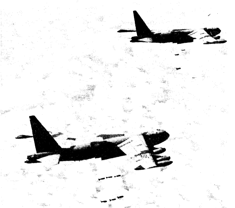
North Vietnamese downed 20% of U.S. Pacific B-52 fleet with obsolete SAM-2 missiles. Soviets saved modern SAM-3's and 4's for capitalist Egypt.

The record of Soviet betrayal in Vietnam is well documented—from Stalin's Teheran proposal to place Indochina under Chiang Kai-shek's "trusteeship," to the 6-year period following the foundation of the DRV and the anti-French struggle where the Soviets withheld both military aid and diplomatic recognition, to the Geneva accords of '54 and '62, to the present period. Throughout, the Soviet bureaucracy has demonstrated that the Vietnamese revolution is at best a pawn to be sacri-