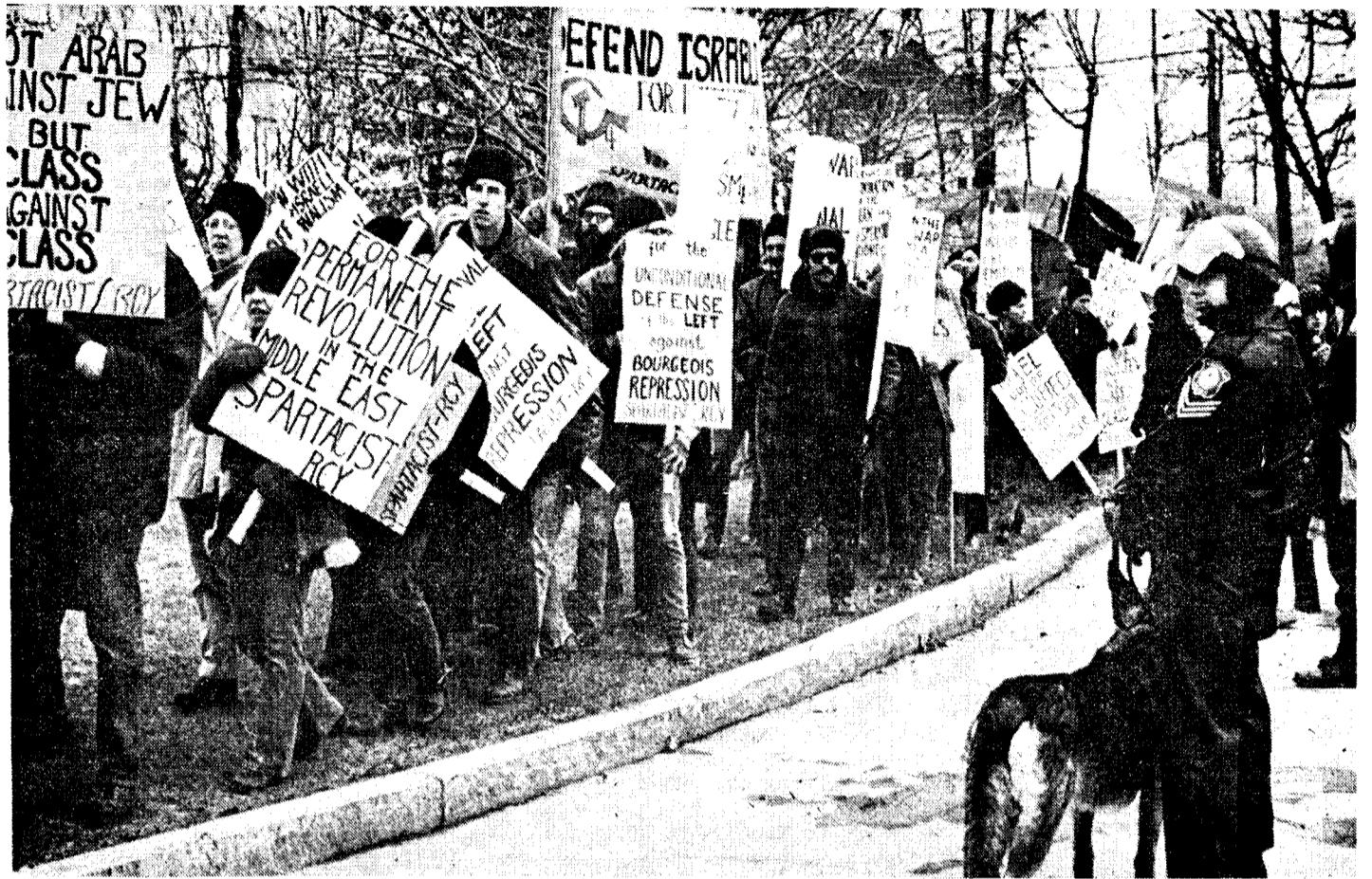
Defend the Israeli Left! SL/RCY demonstrate against Golda Meir at Brandeis University.

The Progressive Labor Party, after receiving the RCY's call, held its own demonstration on 19 February (two days prior to the RCY-called demonstration) in support of one Israeli group (Revolutionary Communist Alliance). When asked whether it would support the united front, PL refused to even discuss the matter with SL/RCY members, thus demonstrating incredible sectarianism. The Revolutionary Communist Alliance, with which PL has friendly relations, is engaged in Israel in united-front defense work for its own defense and defense of the rest of the left and working-class movement, and has joined in an international appeal for other organizations to do the same. Not only has PL refused to unite with other groups in the U.S. to defend this group, but in its own little sectarian picket line, it did not call for defense of