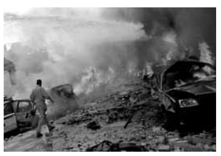
Najaf, August 29. Car bomb killed prominent Shi'ite cleric who collaborated with U.S. occupation forces.

$15 from SV Publishing Co., P.O. Box 769, Washington Bridge Station New York, NY 10033