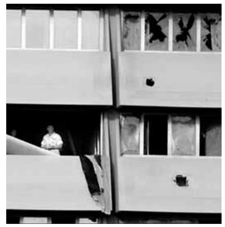
Baghdad, October 26: Hotel where U.S. Deputy Defense Secretary was staying was hit by missile.

occupy the country for years, with over 100,000 committed at least until the end of 2006. But this new plan may also collapse in the face of rising struggles of the Iraqi masses and the developing crisis of world capitalism, which increasingly limit the U.S.'s ability to take decisive action.