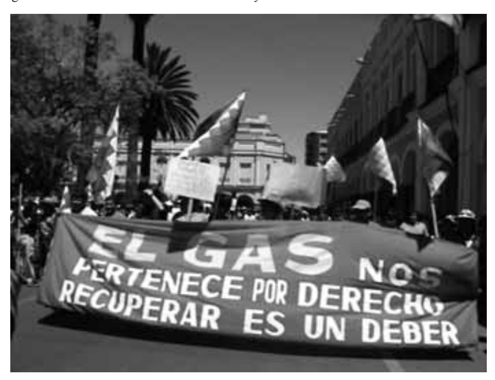
September 14, protest in Cochabamba against government plan to sell off natural gas reserves to an imperialist consortium.

Within such councils revolutionary workers, even an initially small revolutionary group, could have fought for its program and its leadership – and over time have won the most far-seeing elements to the task of building a vanguard party. Democratic and potentially revolutionary formations like soviets were an absolute necessity in the Bolivian upheaval and represent a deadly threat to the entrenched reformist union leaders. In Russia in 1917, at the outset of the revolution the Bolsheviks were a small but determined proletarian vanguard organization. Through steadfast adherence to the principles of working-class independence and leadership, and adroit tactics designed to expose the pseudo-revolutionary socialists, they were able to lead the working class to power in the October revolution. It is indeed a tragedy that there was no Bolshevik Party in Bolivia in 2003.