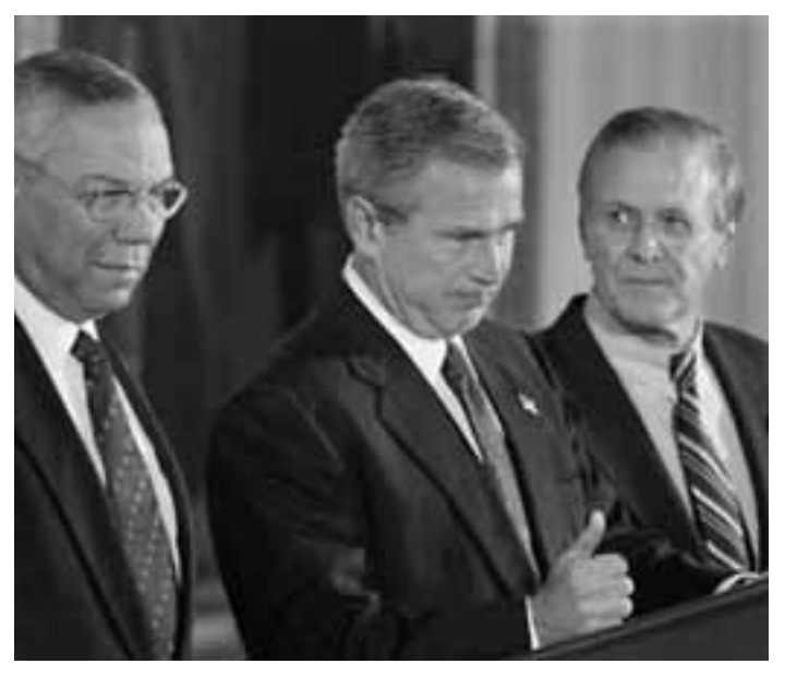
Powell, Bush and Rumsfeld faced with contradictions over "democracy" and control in Iraq.

Instead, U.S. pro-consul in Iraq Paul Bremer announced in mid-November that he would hand over power to a sovereign Iraqi government by July 2004 following what White House officials privately describe as "partial elections" – where the only people with the right to vote will be political "notables, elders and tribal chieftains" pre-approved by the U.S. So much for bringing democracy to Iraq! Further, U.S. troops will continue to