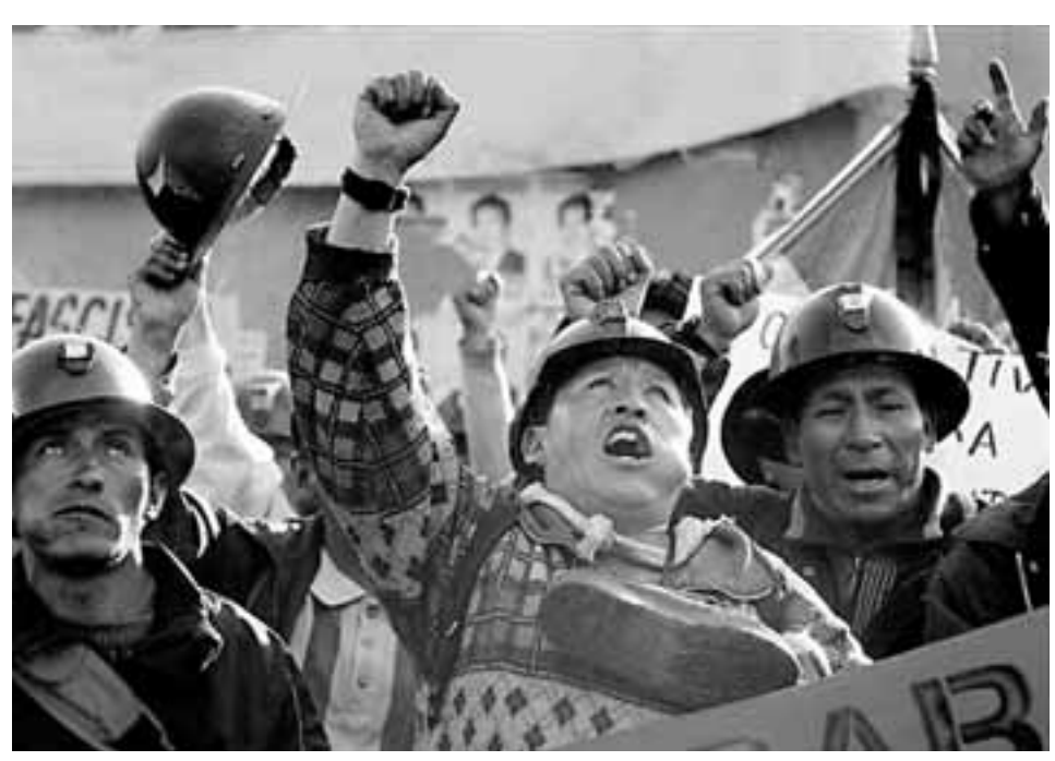
Bolivian miners celebrate Sánchez de Lozada's resignation October 17, 2003.

The list of radical-sounding demands for show was not all the leaders had to offer that day. The expanded COB meeting paid homage to the greatness of the masses and to revolutionary goals. According to reports, it drew the conclusion that "the workers, peasants, oppressed nations and impoverished middle classes did not seize power from the