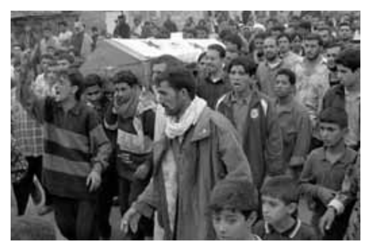
Baghdad, November 10. Iraqi Shi'ites with casket of U.S.-appointed mayor of Sadr City, killed by U.S. sentry.

Second, it is true that most attacks have taken place in the "Sunni Triangle," where most of the occupation forces are concentrated. But approximately 40 percent of attacks have taken place outside of this area, from the predominantly Shi'ite South to Kurdish areas in the North. The guerrillas in these areas clearly rely on at least the loyalty if not active support of the local population for their operations. Recent studies of captured, injured and killed guerrillas have confirmed that the guerrillas come from among not just the Sunnis, but Shi'ites, Christians, Turkomen and Kurds as well. In fact, while the Western media have tried their best not to report it, occupation forces deep in the predominantly Shi'ite South of the country, where there are few Sunni Muslims, face frequent and increasing attack, sustaining deaths and many casualties. Spanish forces around the Shi'ite centers of Najaf and Diwaniyah have even come under artillery attack. In the North, major attacks have been conducted by the guerrillas of the nationalist Kurdistan Workers Party (PKK), forcing the U.S. to promise Turkey that it will launch an offensive to "eradicate" the thousands-strong group.