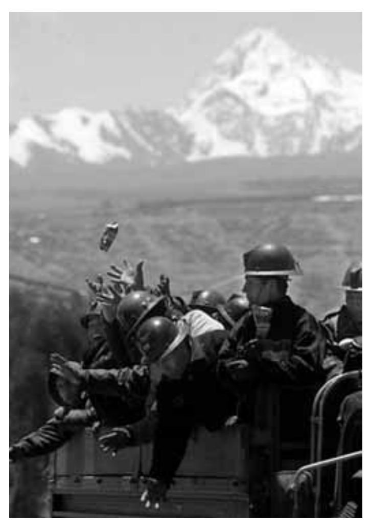
Miners receive food from residents of El Alto as they pass through. The fervent solidarity demonstrated within the working class – and between workers and peasants – was a tremendous achievement of the struggle.