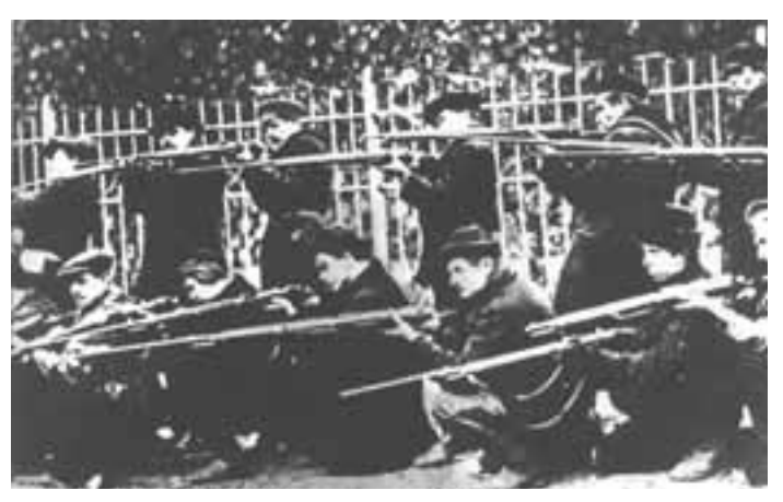
Red Guards training in Petrograd, 1917. Workers and peasants conscripted into the Czarist army brought their military skills to the aid of the workers' revolution.

A newspaper reported that he was asked whether workers should refuse to be drafted and sent to the front. (The Russian